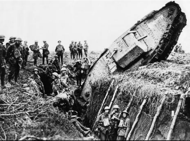
Source A: A photograph of a British Mark IV tank "Hyacinth", 20 Nov 1917

TASK: Study Sources A, B and C. How far do these sources agree about the impact of tanks? Explain your answer by referring to points of agreement and disagreement between both sources. [6 marks]