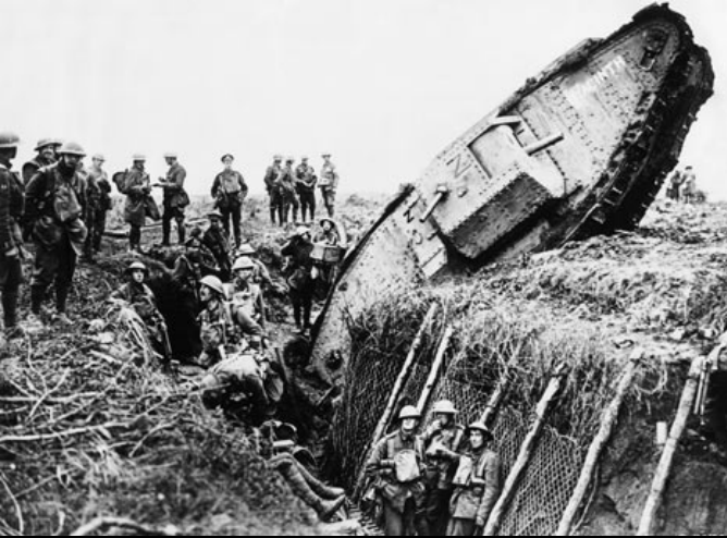
Source A: A photograph of a British Mark IV tank “Hyacinth”, 20 Nov 1917